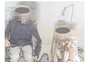
Fig #3 WIF points at screen