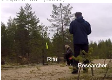
Figure 5a (cam2)

03 •%*(6.0)•% cam1 •focuses on H• hip %runs fwd%no longer visible in cam1&2--> res *looks fwd-->