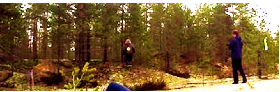
Figure 5d (cam2)

12 *%#(2.0)•(0.9) res *turns head right--> hip %approaches R from right--> cam1 -->•turns to H--> fig #5e