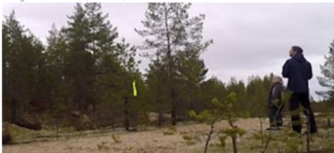
Figure 5c (cam2)