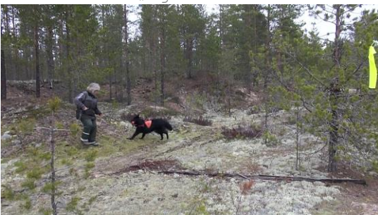
Figure 5g (cam1)

14 +(1.0)• rit +turns right twd H cam1 -->•follows H-->> 15 RIT: +.heh:: fa::#::i että£,+% (.) hie:nosti,+ heh oh so nicely, +runs twd H-----+stops and directs H to heeling position+ hip -->%stops fig #5g