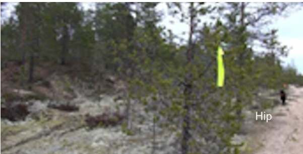
Figure 5f (cam1)

13 RES: täältä tulee.# here {she} comes. fig #5f