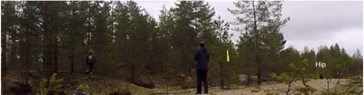
Figure 5e (cam2)

12 *%#(2.0)•(0.9) res *turns head right--> hip %approaches R from right--> cam1 -->•turns to H--> fig #5e