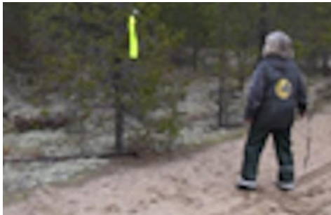
Figure 5b (cam1)

04 *(1.0)#•+(0.8)*+(5.3) cam1 •turns to R--> rit +jumps--+8 steps bwd--> res *gaze R-----*looks fwd & steps sideways, maintains position in relation to R--> fig #5b