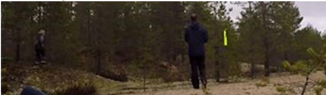
Figure 5f (cam2)

14 +(1.0)• rit +turns right twd H cam1 -->•follows H-->> 15 RIT: +.heh:: fa::#::i että£,+% (.) hie:nosti,+ heh oh so nicely, +runs twd H-----+stops and directs H to heeling position+ hip -->%stops fig #5g