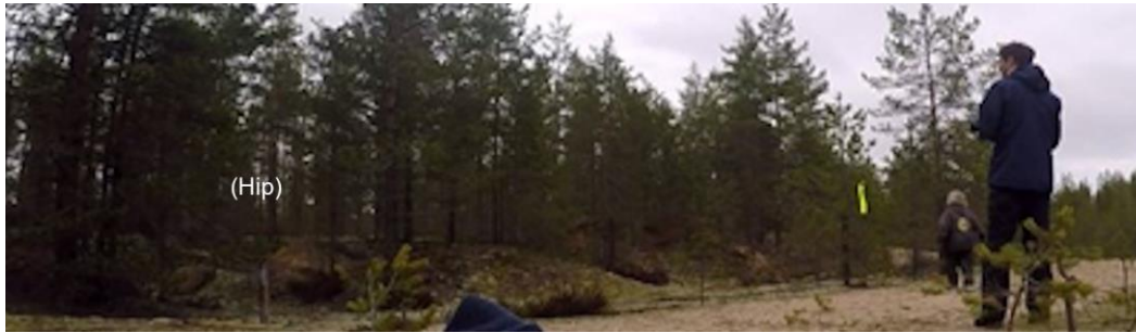
Figure 5b (cam2)

05 RIT: HYVÄ::?+* good rit -->+stops and looks fwd--> res -->*