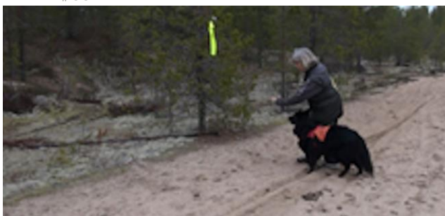
Figure 5a (cam1)

02 RIT: +*>uk#ko<.+ (search command) +lh points fwd+watches H--> res *looks at R and H--> fig #5a