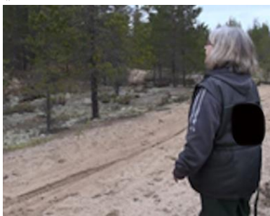
Figure 5c (cam1)

08 #(3.5)+(3.5) rit +walks fwd--> fig #5c