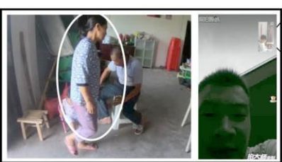
3d (line 10)