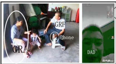
3a (line 10)

left: extra camera in child's house; right: screen capture of phone