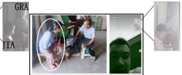
3b (line 10)