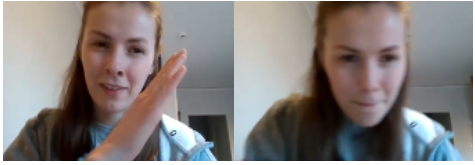
FIG 1: Hand in oblique position

01 AUD: at hh, that 02 (0.7) eh jeg vet ikke helt uh I do not know really 03 hvordan jeg ellers skal forklare det .hh how I else should explain it 04 (0.2) 05 AUD: [hvis bakken går sånn] if the hill is like this 06 EYA: [du kan skriver ] you can write 07 AUD: her(.)så er det bratt# . here then it is steep fig 1 08 (0.2) 09 EYA: du kan [ skriver det . ] you can write it 10 AUD: [men den går litt sånn her<] but it goes a bit like this here 11 (0.4) he# ? hu fig 2 12 (0.2) 13 ->EYA: *du kan skriver det . you can write it gif *6--> 14 (0.6)* gif -->*6 15 EYA: *e kan du skrive det ? uh can you write it gif *7--> 16 (0.5)(0.3) (0.5)(0.6) 17 chat *du kan skrive denne tre (.) you can write this three gif -->*7 18 tre forskjellig three different