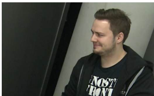
#fig. 2b (Zoom)