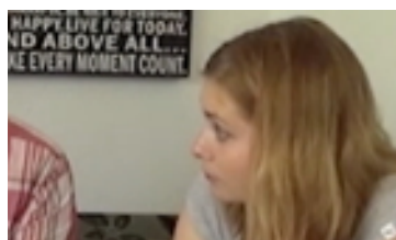
#fig. 4b (Zoom)