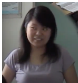
Figure 1.3. The teacher holds the raised eyebrows and tilt head at the beginning of line 19.

Tch eyebrow |raised** Tch head |tilt**** 18 (1.4)