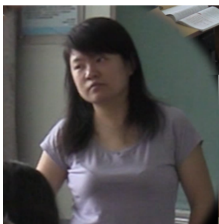
Figure 1.1. The teacher's head and eyebrows position at the beginning of line 18.

01 Tch: di sange wenti. number three question 'The question number three.' 02 <NAME:STA.> (12 lines are omitted in with StA retells an utterance of the characters, who is referred as to ta 'he' in line 15.) 15 StA: ta yao:: e:. 3sg want FP 'He wants... uh...' 16 (1.0) 17 jing(.)jingSHEN- vigor 'vigor.'