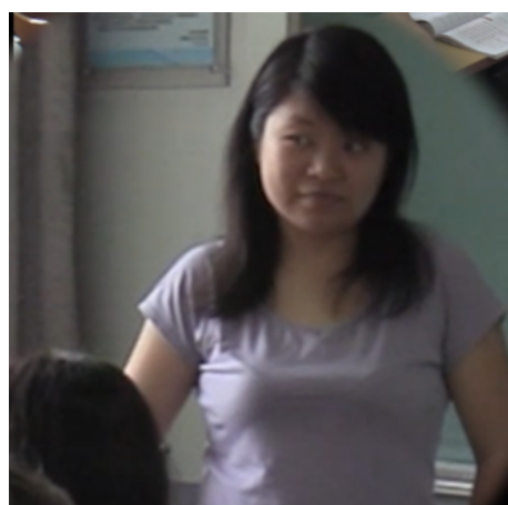
Figure 1.2. The teacher tilts her head and raises her eyebrows after 0.5 second in line 18.

Tch eyebrow |raised** Tch head |tilt**** 18 (1.4)