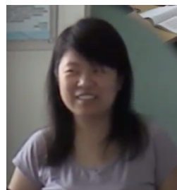
Figure 1.5. The teacher lowers her eyebrows and moves her head to the home position at the end of line 19.

Tch eyebrow *****| Tch head *****| 19 Tch: [|] 1 (0.5) (0.3)