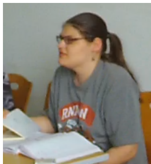
Figure 1.6. StA looks at the teacher in line 20.

Tch eyebrow *****| Tch head *****| 19 Tch: [|] 1 (0.5) (0.3)