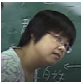
Figure 2.2. The teacher tilts her head and maintains this position for 1.7-second in line 5.