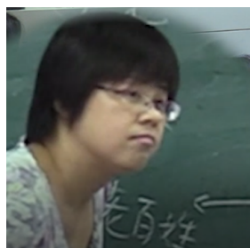
Figure 2.1. The teacher pulls her lip corner downward and raises her eyebrow at the beginning of line 5.

01 Tch: gongchandang shuo qunzhong . communist party say crowd '(When) the Communist Party says multitude,' 02 shi shenme ren ; COP what people 'what people are they referring to?' 03 (1.8) 04 StA: suoyou ren . all people 'Everyone.'