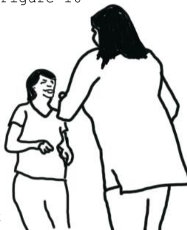
Figure 16. Staff 1 and Pat march to the beat

3 (0.5)*+Δ (0.3)*+ (0.5)*(0.5)Δ# a st2 *lets go *turns--*claps to beat-> b st1 +lets go +steps to beat->> c pat Δturns, gz Staff 1---Δsteps to beat-> d fig #Figure 16