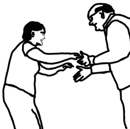
Figure 18b. Pat and Dave grasp hands