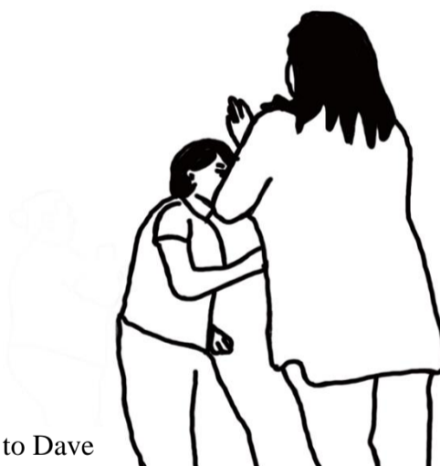
Figure 17. Pat walks to Dave

4 (3.0) (0.2)+(0.5)Δ (0.8) (1.2)Δ# a st1 ->+gaze floor, claps hands->> b pat ->Δgz to Dave---Δ#walks to Dave-> c fig #Figure 17