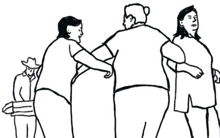
Figure 15. Staff 2 walks past Pat's open arm

1 pia wo:oah ka:ay here we go:o(.) ♪ Δ (0.5)*# a mus ♪music speeds up double time->> b pat Δopens arm to St2((wrong arm)) c st2 *#walks past Pat's arm d fig #Figure 15